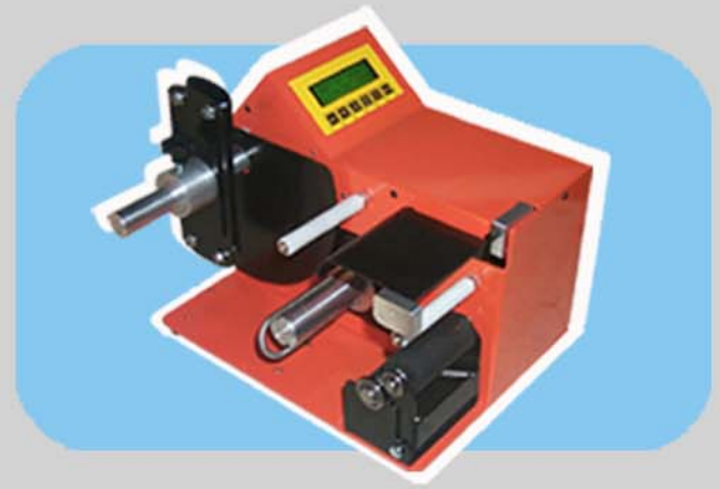
Model DP 03